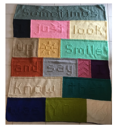
1st Prize"Sometimes" Blanket Approx 54" x 67" "Sometimes I Just Look Up Smile and Say I Know That Was You"