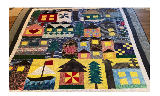
3rd Prize Handmade Lap Quilt