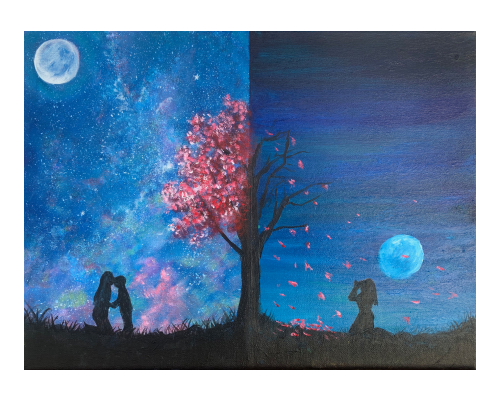
2nd Prize "The Gift/The Loss" 12" x 16" Painting